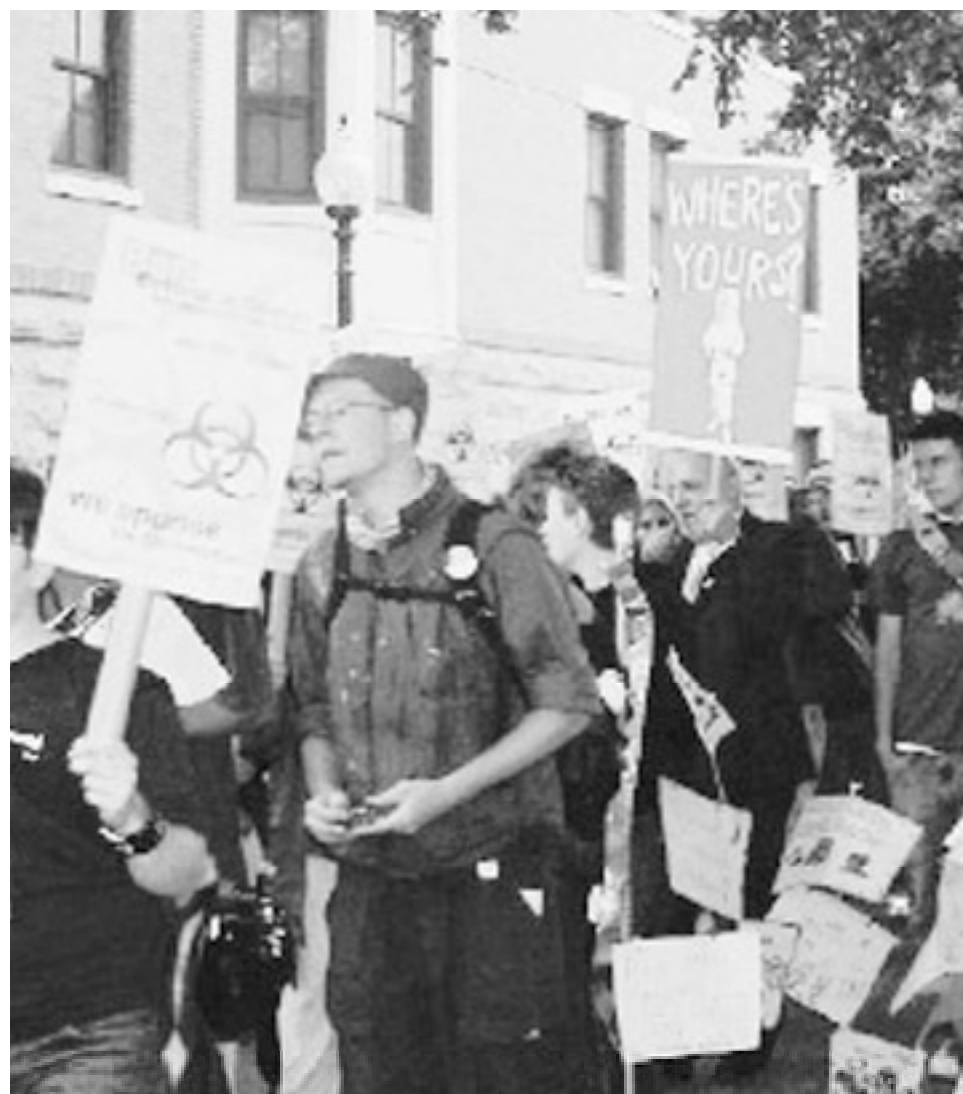
Green-Rainbow joins protest against BU Bioterror Lab