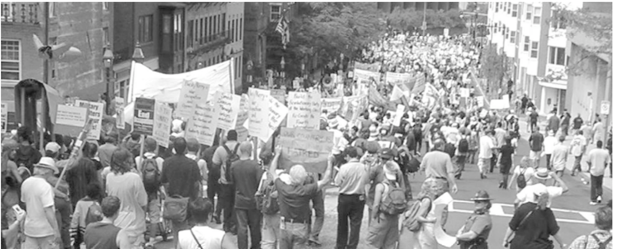
Thousands move through the militarized streets of Boston toward the site of the 2004 Democrat National Convention in a demonstration led by the ANSWER Coalition.