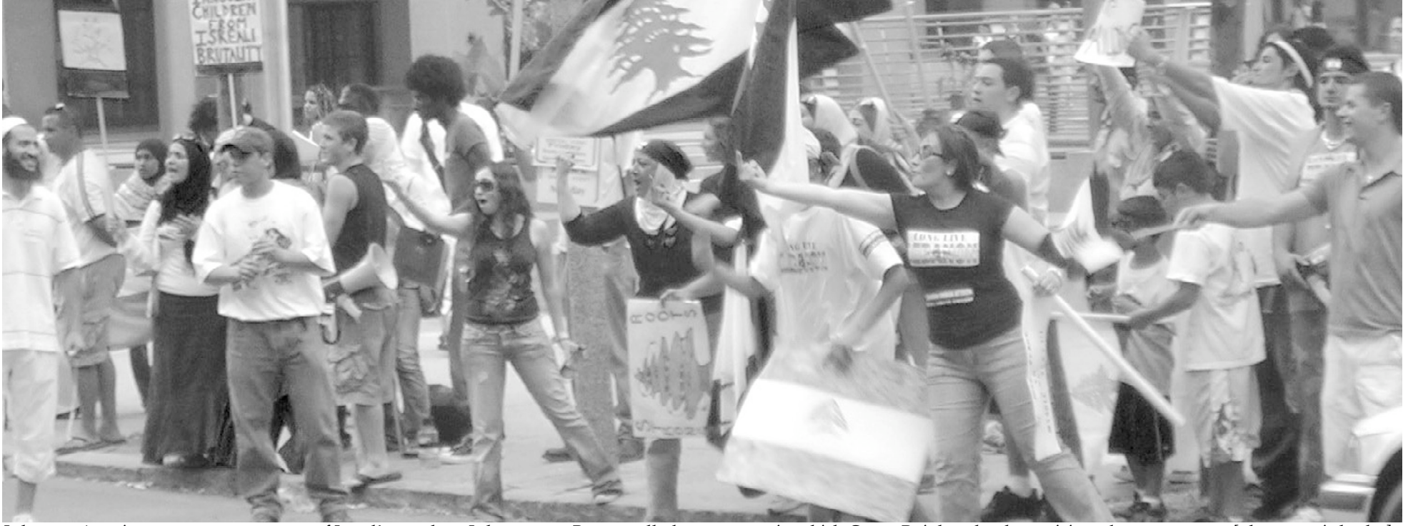
Lebanese-Americans react to supporters of Israel's attack on Lebanon at a Boston rally last summer, in which Green-Rainbow locals participated