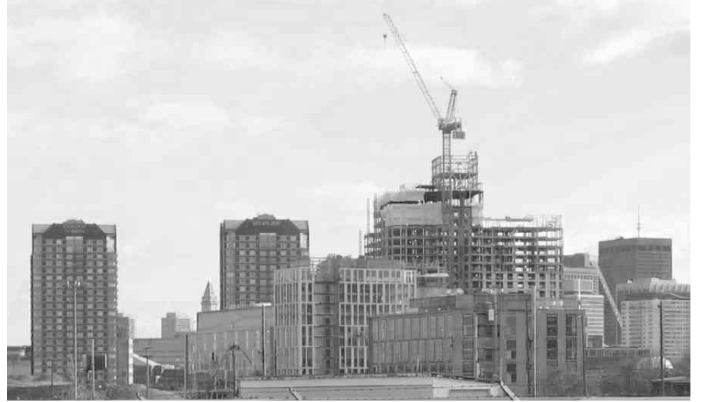
North Point construction seen from Cobble Hill, Somerville

"Expediting the permitting process is going to make these problems worse. The permitting reform that we really need is to implement a careful, open and honest permitting process and to make sure it isn't subverted by the influence-peddling of politically connected developers."