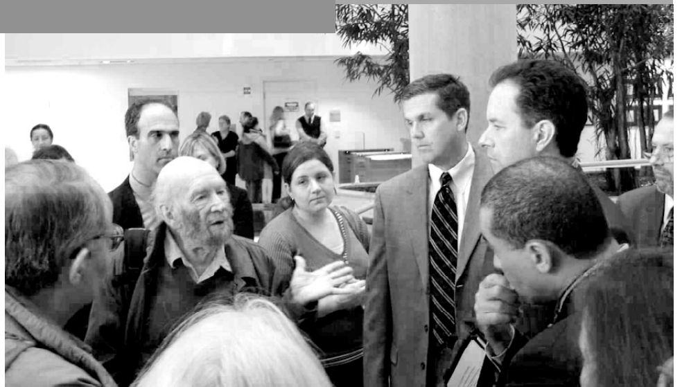
Citizens, including Green-Rainbow activists, confront Governor and top development aides at a February press conference in Cambridge.